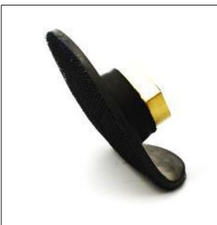
Model : Sanding Flex (MP21-19) Standard : 2" – 50x50mm 3" – 75x75mm 4" – 100x100mm RPM : RPM 5500 – 8800