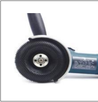
Model : 4" Sanding Wheel (MP21-17-4) Standard : 100x100x16mm RPM : RPM 11000 – 15400