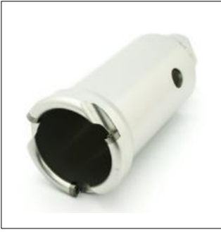
Model : 3" Holes Cutter (MP21-8-3) Standard : 140x70x70mm Diameter : 70mm RPM : RPM 11000 – 15400