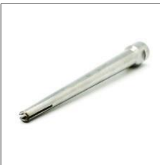
Model : Assistant tool 2 (MP21-13-2) Standard : 150x15x15mm