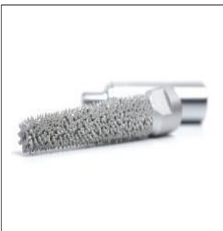
Model : Sanding Shaft (MP21-18) Standard : 10x10x100mm RPM : RPM 11000 – 15400