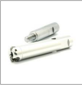
Model : Crack Cutter (MP21-16) Standard : 20x20x100mm Diameter : 20mm RPM : RPM 11000 – 15400