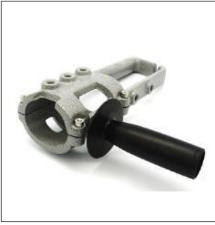
Model : Grinder Holder (MP21-9) Standard : 280x100x70mm