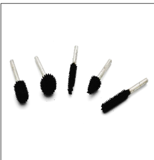
Model : Rotary Burrs (MP21-21-H) Standard : 1/8" Shark RPM : RPM MAX 25000