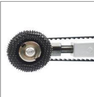
Model : 2" Sanding Wheel (MP21-17-2) Standard : 45x45x8mm RPM : RPM 11000 – 15400