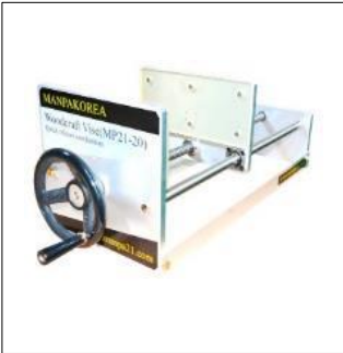
Model : Quick release Vise (MP21-20-600/1000) Standard : 650x260x260mm 1000x260x260mm