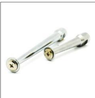
Model : Assistant tool 1 (MP21-13-1) Standard : 90x15x15mm 150x15x15mm