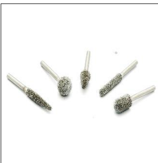
Model : Rotary Burrs (MP21-21-S) Standard : 1/8" Shark RPM : RPM MAX 25000