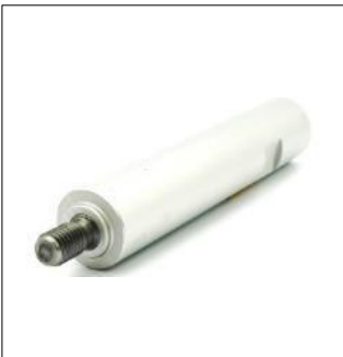
Model : Sanding Tool (MP21-12) Standard : 140x25x25mm