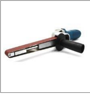
Model : Belt Sander (MP21-14) Standard : 300x160x17mm Diameter : Width 30mm, Thickness 17mm RPM : RPM 11000 – 15400