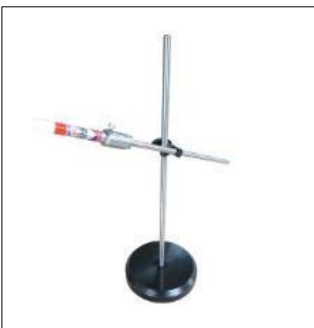
Model : Horizontal drawing (MP21-15) Standard : 370x160x160mm